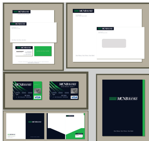
A collection of professional designs provided to MCNB Banks by Identity America includes, letterhead, brochures, business cards, envelopes, banking and credit cards, and much more.